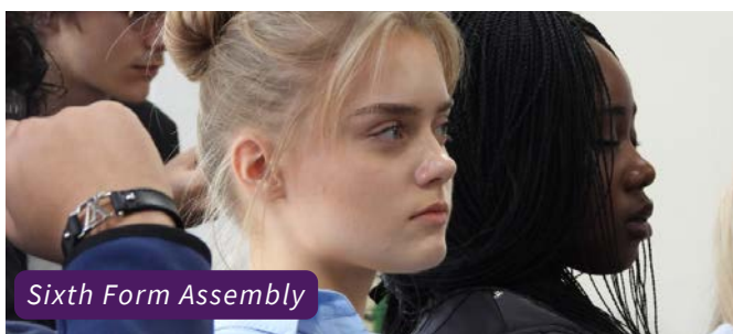
Sixth Form Assembly

A number of our Year 12s have put themselves forward to interview for the coveted position of School Captain - an exciting leadership opportunity for students during their upper sixth year. We can't wait to announce our new school captains when we return in September!