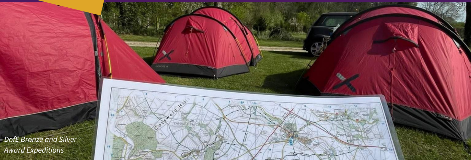
DofE Bronze and Silver Award Expeditions