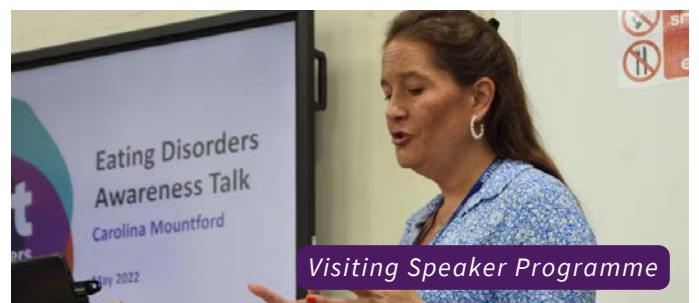
Visiting Speaker Programme

PSHE is a vital part of the Sixth Form curriculum as we support our students to remain happy, healthy, safe and prepared for life beyond school, and we look forward to continuing to develop and extend the programme next year.