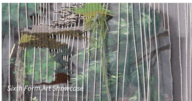
Sixth Form Art Showcase

This term, we have celebrated creativity in all of its forms as both the Lower School and Sixth Form hosted art exhibitions to showcase student talent.