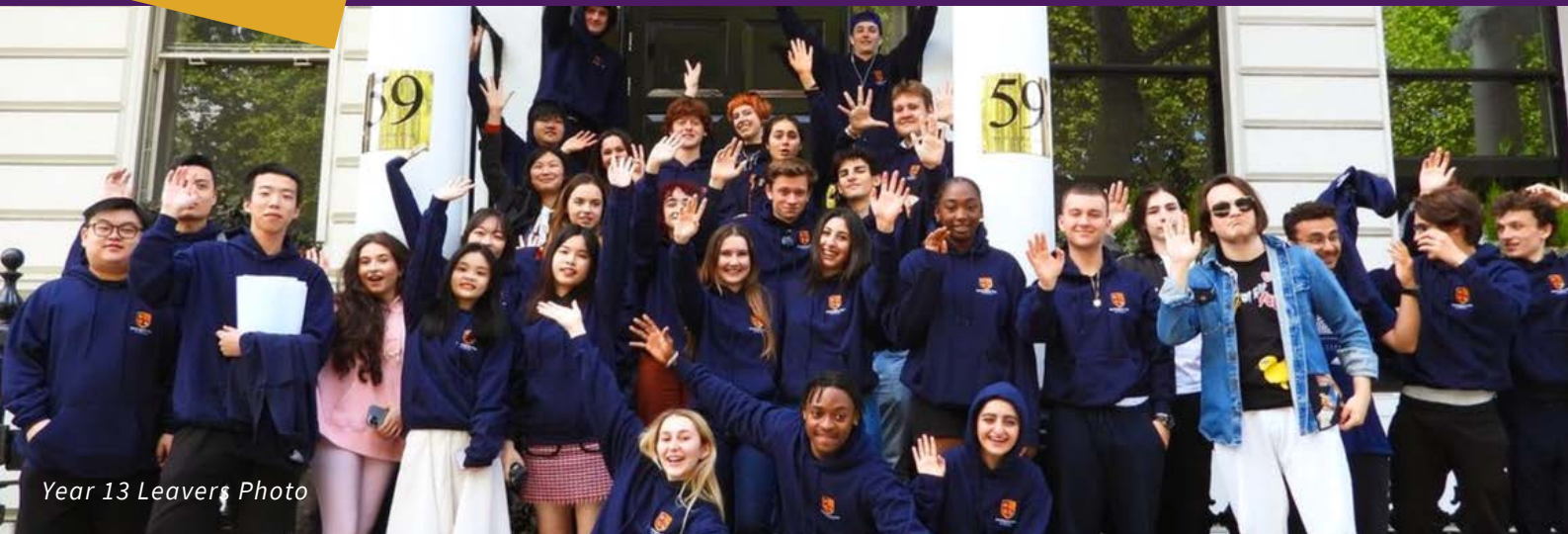
Year 13 Leavers Photo