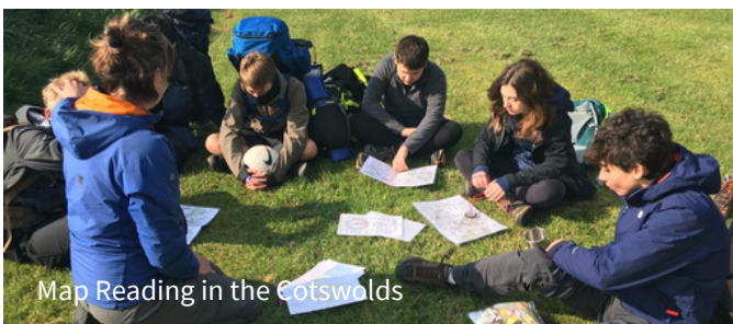
Map Reading in the Cotswolds