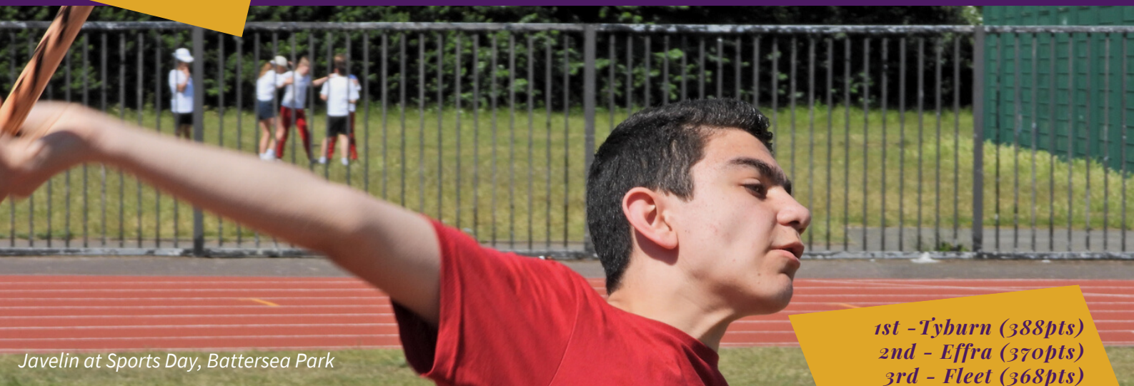
Javelin at Sports Day, Battersea Park

1st - Tyburn (388pts) 2nd - Effra (370pts) 3rd - Fleet (368pts) 4th - Walbrook (298pts)