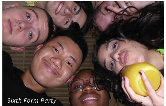
Sixth Form Party