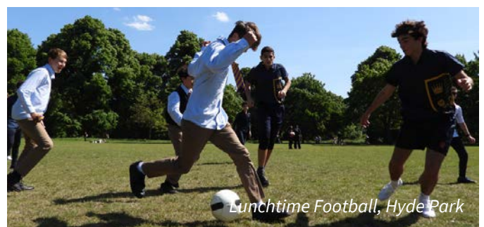
Lunchtime Football, Hyde Park

Our sport clubs have remained popular, with Eton Fives, climbing, and ice-skating continuing to be firm favourites, not forgetting the now infamous KPS Dodgeball — a new addition which has already become a staple in the sporting schedule!