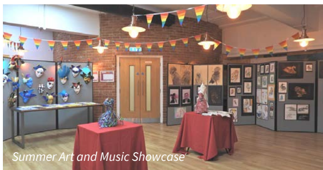
Summer Art and Music Showcase