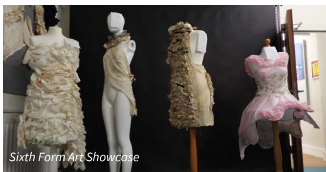
Sixth Form Art Showcase