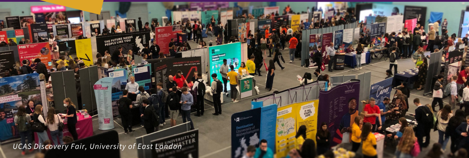
UCAS Discovery Fair, University of East London