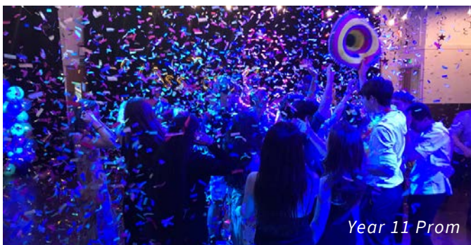
Year 11 Prom

This remarkable year group were some of the first students to join the Lower School when we opened our doors in 2018, and we are incredibly proud of all they have achieved during their time here. We look forward to welcoming many of them to the Sixth Form in September, and wish all our Year 11 students a well-deserved rest over the summer!