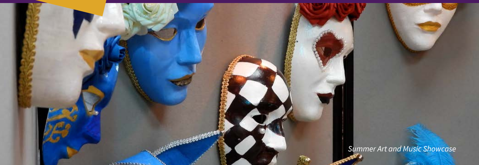
Summer Art and Music Showcase