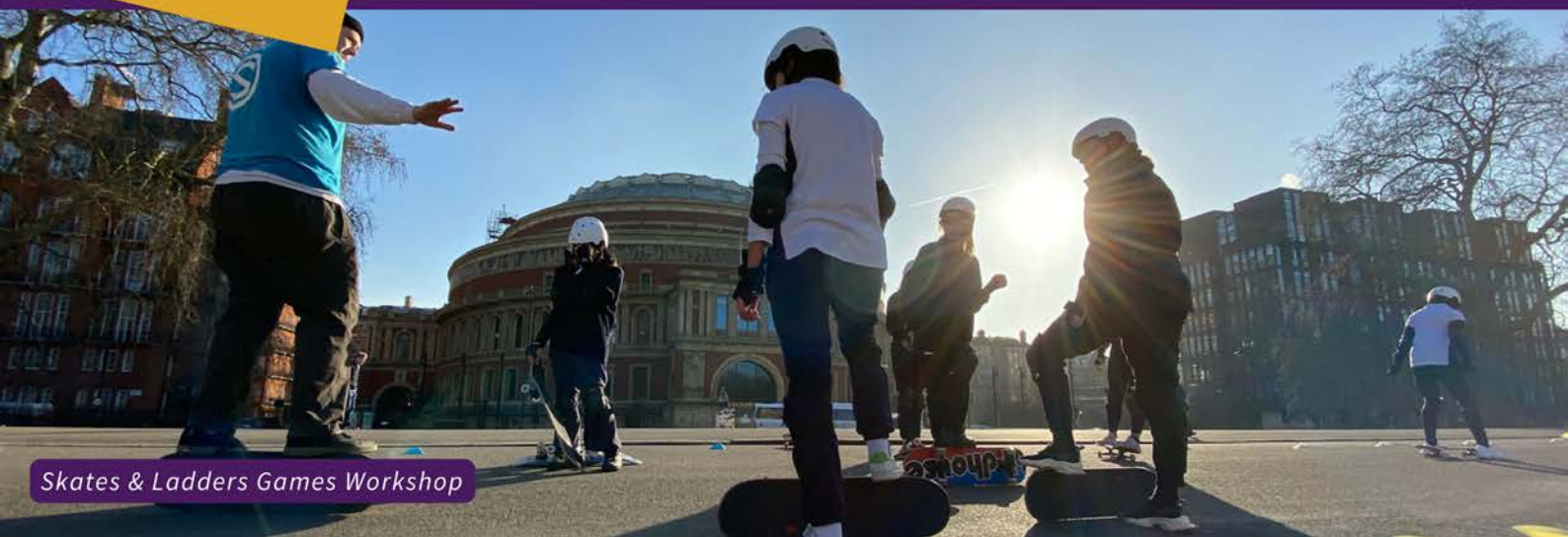
Skates & Ladders Games Workshop