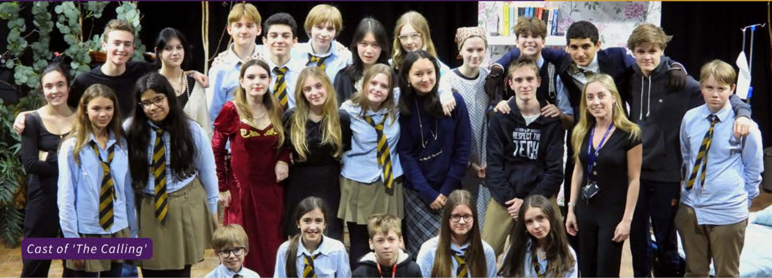
Cast of 'The Calling'