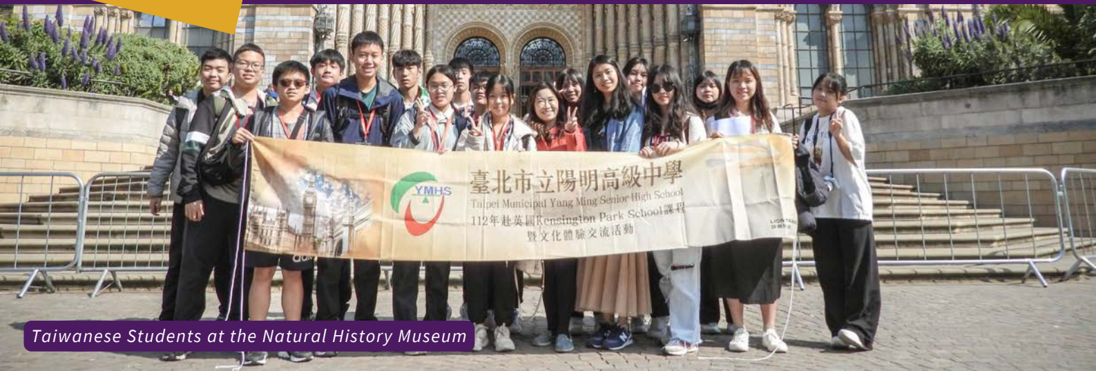
Taiwanese Students at the Natural History Museum