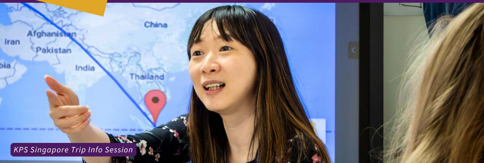
KPS Singapore Trip Info Session