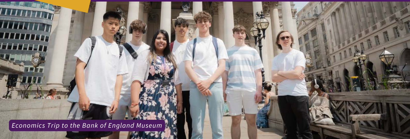
Economics Trip to the Bank of England Museum