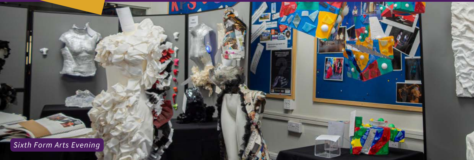
Sixth Form Arts Evening