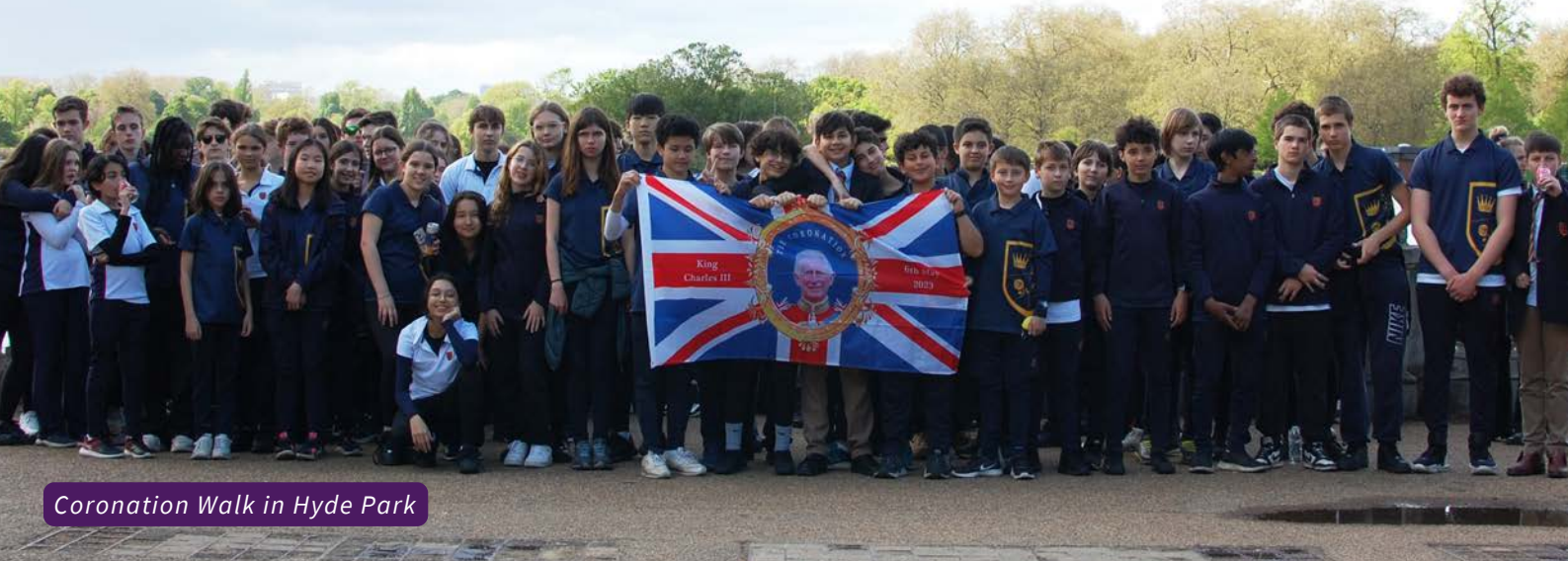
Coronation Walk in Hyde Park

It has been another jam-packed term, with our Creative Arts evening, Sports Day, the Year 11 and Sixth Form Proms, an exchange programme with Taiwan, and a trip to Italy!